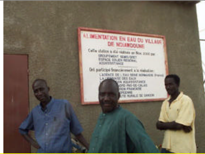
Ndiawdoune : Local management committee