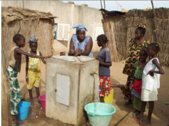
Ndiawdoune : near the public fountain