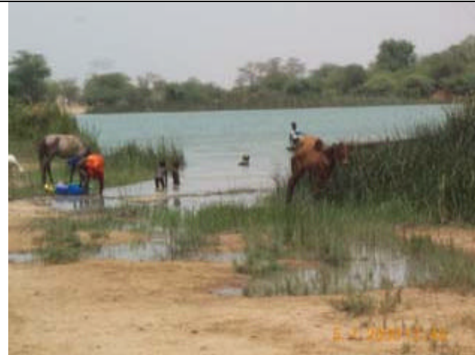
Guidakhar : Women and children in river water