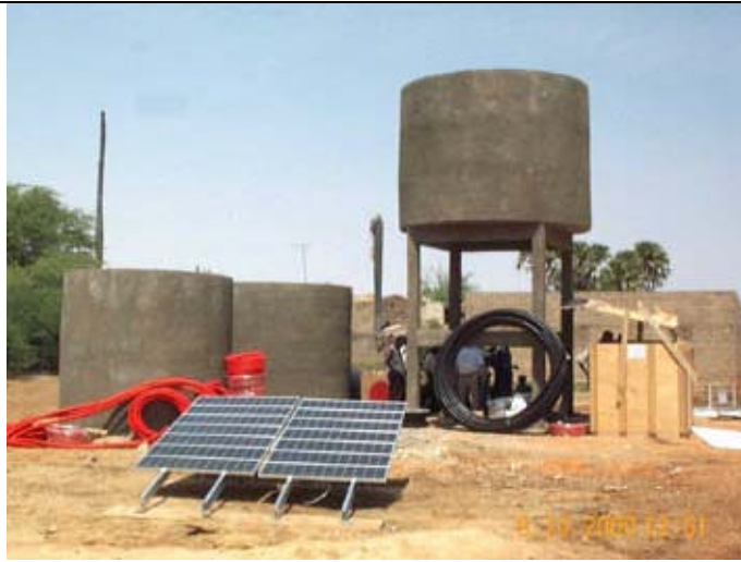
Guidakhar : station in works