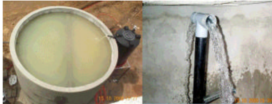
Right : after treatment